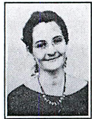
Maria Elena Cruz Varela

The Cuban poet Maria Elena Cruz Varela, who in 1991 was convicted to two years in a Cuban prison, was released by the authorities on 24 May for good behaviour, six months before her prison term was over. The dissident went immediately to her father and brother in the province of Matanzas. According to information obtained by Amnesty International, the Cuban authorities had gone to Ms Cruz Varela's flat in Havana and moved all her belongings to Matanzas. It is as yet unclear whether or not her release was under condition of her moving to Matanzas. Maria Elena Cruz Varela belonged to the dissident group Criterio Alternativo before her arrest and is actively supported by the Cuban Liberal Union. She was awarded The Liberal International Prize for Freedom 1992. The presentation of the Prize at the LI Congress in Mainz in September 1992 by German Justice Minister Leutheusser-Schnarrenberger was experienced by most Congress delegates as one of the most moving moments of the Congress. The Liberal International will continue to actively monitor her situation.