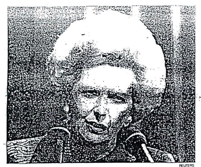
British Prime Minister Margaret Thatcher addresses the World Economic Congress meeting in Washington.