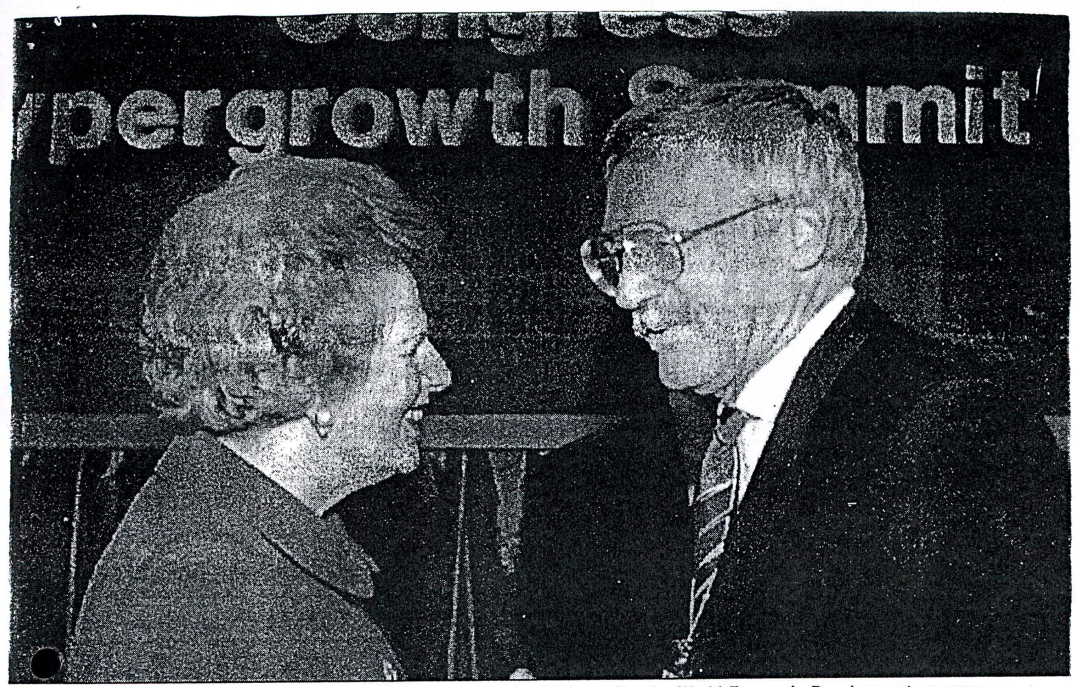
Lady Thatcher talking with Czech prime minister Vaclav Klaus during the World Economic Development congress.