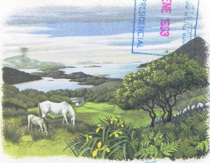
Connemara National Park, Co. Galway

Sender's name and address Ainm agus seoladh an tseoltóra