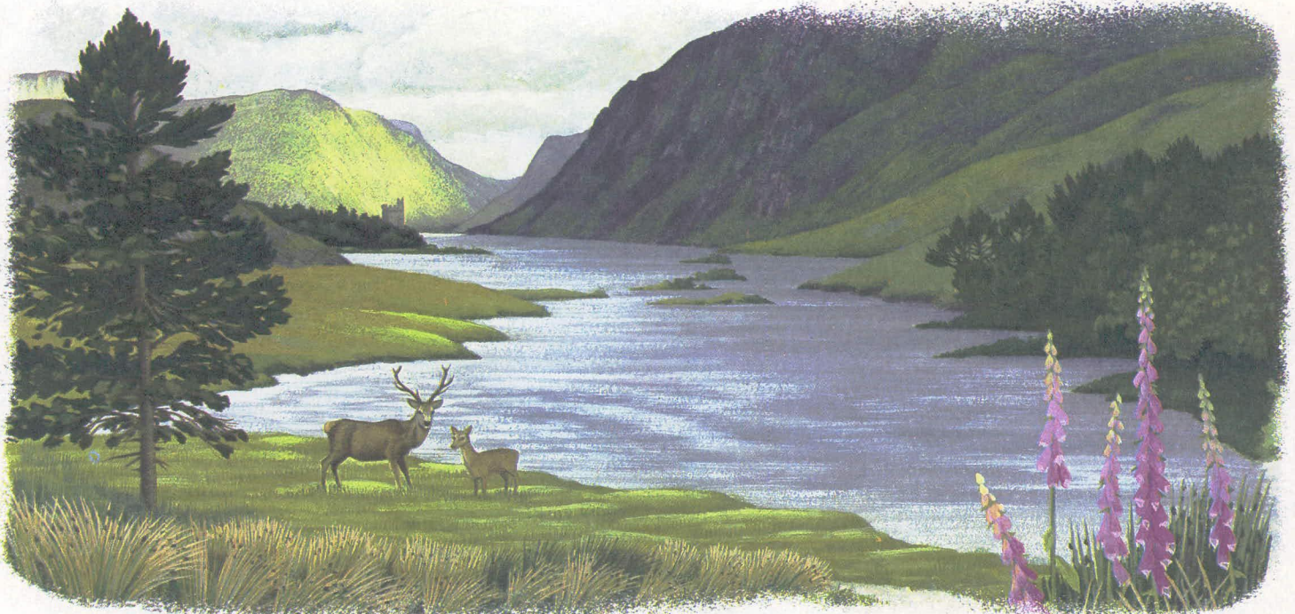
Glenveagh, Co. Donegal